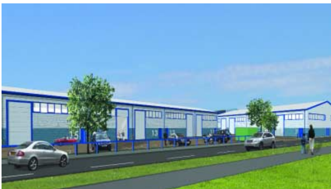
Artist's impression of the proposed scheme

Located off Jeffrey's Road, running parallel with Mollison Avenue (A1055), Riverwalk Business Park is ideally positioned for any business with its easy connections to the A10/M25, the North Circular,