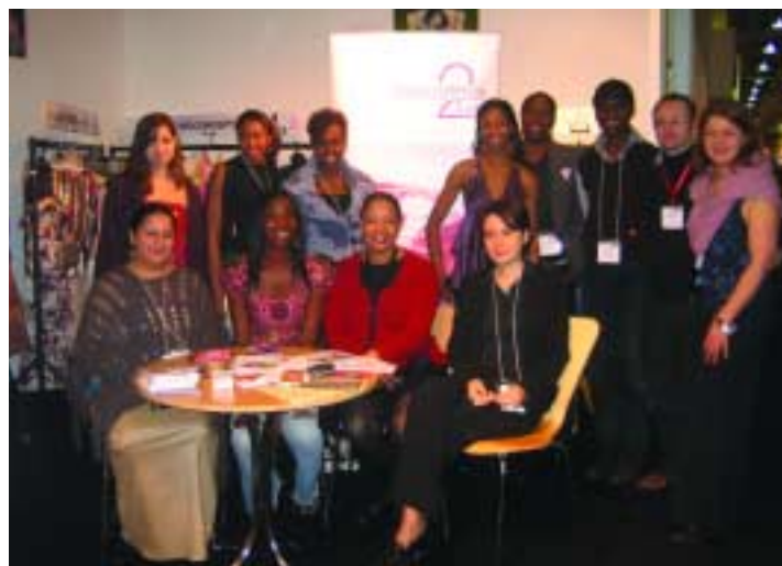
GG2T at its final event aiding BAME creative industries

Smaller enterprises have few resources and for some working overseas is simply too big a step to take alone. The project's